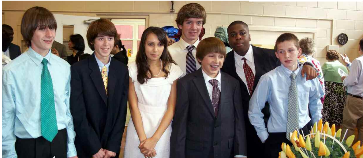
A Celebration for our Seven Confirmands was held on Sunday, October 23.