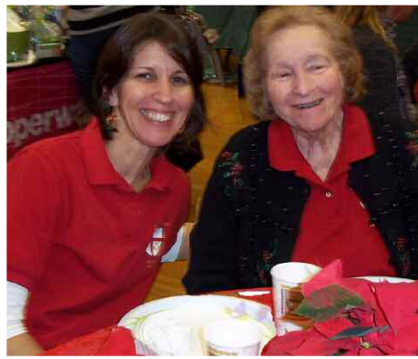
The St. Nicholas Bazaar was full of the holiday spirit. There was something for everyone! Hats off to the folks who worked so hard to make it a success!